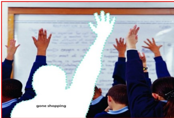
Children miss out if they go out of school in term time